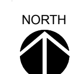
1 FLOOR PLAN 1/4" = 1'-0"